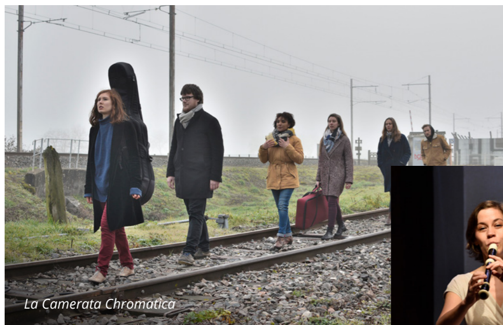
La Camerata Chromatica